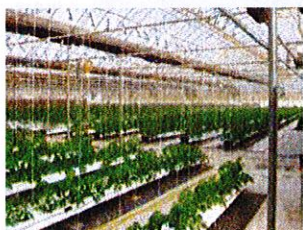
Nursery or Greenhouse (planting, potting, pruning, watering, harvesting, etc.)