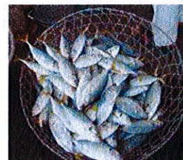
Fishing & Fish Processing (catching, sorting, packing, transporting fish, etc.)

If you answered "yes" to the questions above, please continue below. Otherwise, your form is complete.