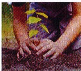
Forestry (soil preparation, planting, growing, cutting trees, etc.)